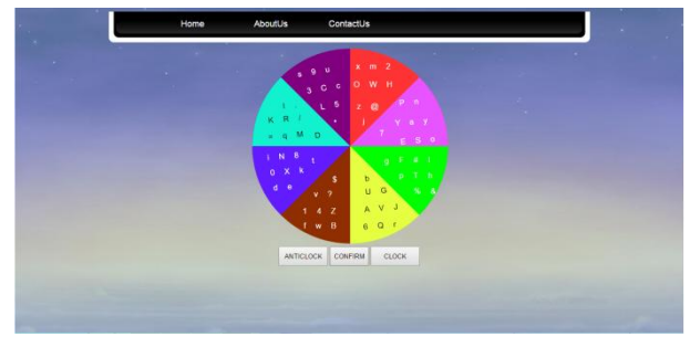
Fig 5.1. S3PASS Authentication phase.

Password received on user mail, the user requests to validate the login into the system. Validation phase of the system displays a circle composed of 8 equally sized sectors. The colours of the arcs of the 8 sectors are different, and each sector is identified by the colour of its