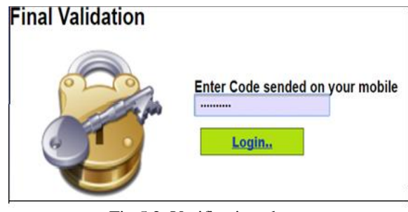
Fig 5.2. Verification phase.

rotated clockwise and anticlockwise by pressing the button characters are placed averagely and randomly among these clockwise and anticlockwise. The mouse wheel can also sectors. All the displayed characters can be simultaneously be used to move the characters from one sector to another rotated into either the adjacent sector clockwise by counter clockwise by clicking the "counter clockwise" button.After selecting each letter of password in that colored arc which user has chosen, he/she have to confirm